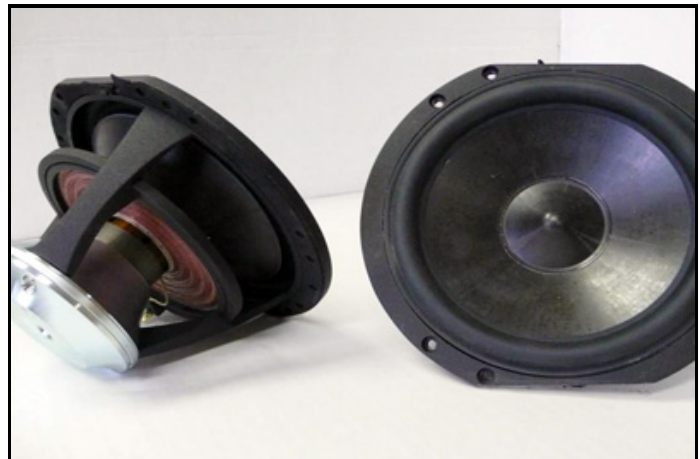
Vandersteen's 7.25" Scan-Speak Illuminator midbass driver, featuring an aerodynamic neodymium magnet system and proprietary cone of carbon-fiber-and-balsa composite.