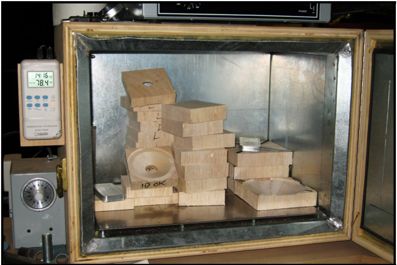
Balsa cut into 4" x 4" x 1.25" blocks, from which the driver cones are machined, "baking" in a special oven to remove all residual moisture -- a necessary step to ensure proper lamination of the cone skins of ultra-high-modulus carbon fiber.

RV: We start off with way more than we ultimately need, given the difficulty of machining it. Through our patented process, we stage the various steps of machining in order to handle it. We end up throwing 90% or more of the material away. But each midrange starts with a 4" x 4" x 1.25" piece, from which the cone is machined out. We segment four pieces together to create the 6" x 6" x 1.5" block from which the midbass cone is machined.