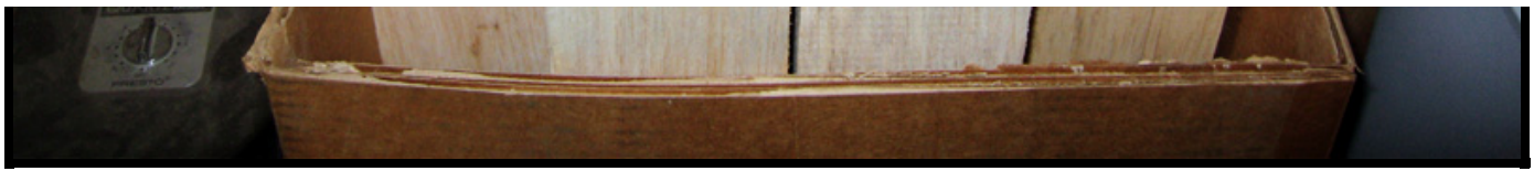
4" x 4" blocks of ultra-lightweight balsa wood awaiting processing.

PR: How much balsa do you need to process to get what you need?